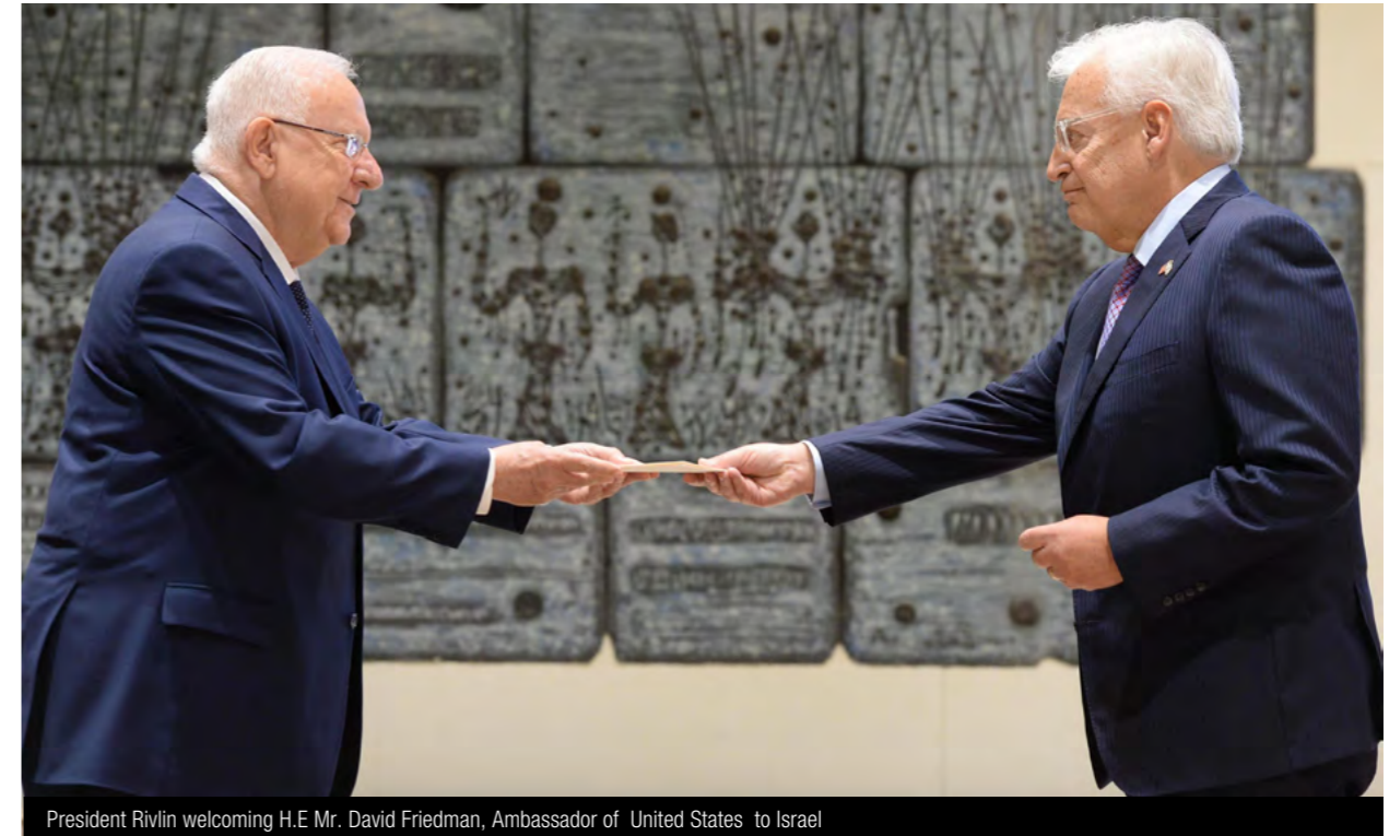
President Rivlin welcoming H.E Mr. David Friedman, Ambassador of United States to Israel

national anthem, 'Hatikva'. After presenting his credentials to the President, President Rivlin congratulated the new Ambassador and said, "I am happy to welcome you and your dear wife to Israel, to Jerusalem. I know you