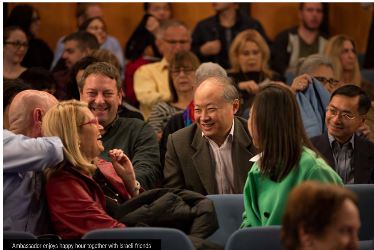
Ambassador enjoys happy hour together with Israeli friends

US dollars, but now it has surged to 11.3 billion US dollars. China is Israel's largest Asian trading partner and third largest trading partner in the world. Trade items of our two countries continuously optimize from food, diamonds, chemicals and other traditional products to electronics, new energy, biotechnology, software, pharmaceuticals. China's total investment in Israel has exceeded 6 billion US dollars. Infrastructure construction is also an important field of bilateral cooperation now. Chinese companies built the Carmel Tunnel, and now are building the Ashdod port, Tel Aviv Light Rail. For better improving and strengthening the