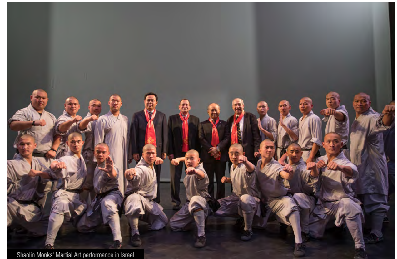
Shaolin Monks' Martial Art performance in Israel

In 1992 when our two countries established diplomatic relations, the bilateral trade volume was merely 50 million