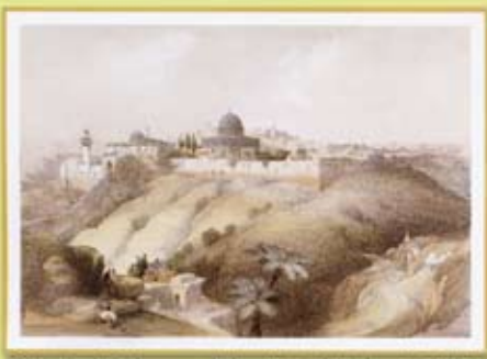
Original Lithograph by David Roberts-1841

Large selection of prints by Roberts, Bartlett, Allom, Turner, Finden and many others.