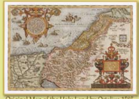
Original Map of the Holy Land by Ortelius-1585